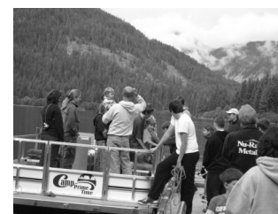
Boat ride on the lake at Camp Prime Time.

For a closer look at the Camp Prime Time experience, visit their website at campprimetime.org