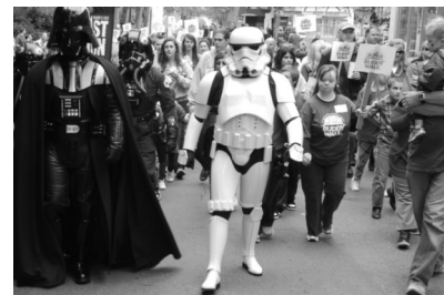
501st Legion Vader's Fist members at the Buddy Walk in their authentic costumes.

Brooks Running Costco Farmhouse Market Fred Meyer, Issaquah Sun Press Printing Tim's Cascade Chips Top Foods